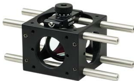
Click to Enlarge The CP360R can be mounted on cage rods inside a C6WR cage cube to hold a Ø1" optic at any chosen angle.