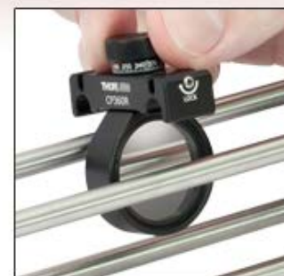
The CP360R Snaps into Place without Cage System Disassembly